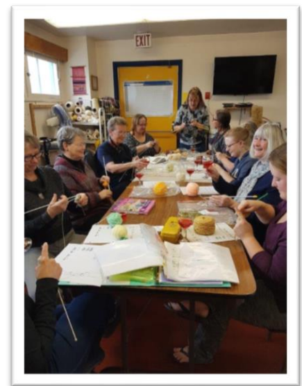
Testing a new Healing Art Kit