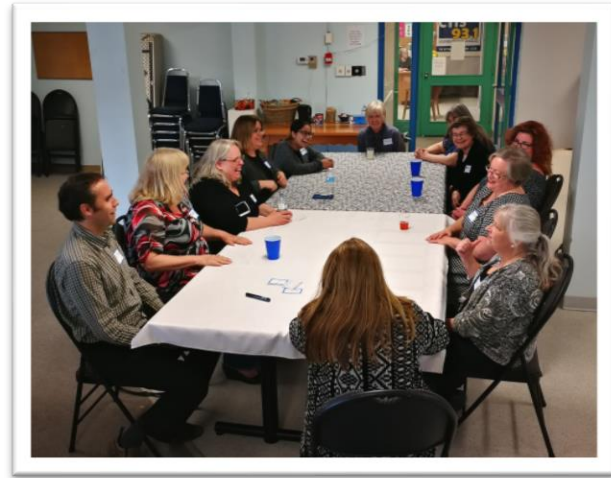
CAC board and staff enjoy a meal together, courtesy of the generous board members.