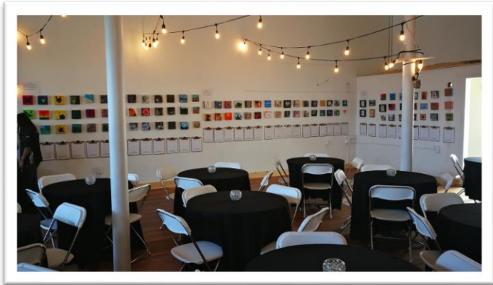
6x6 ready to go at Omineca!