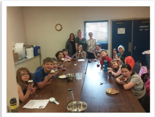
Pro D Day Baking Camp