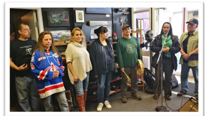
NIAC steering committee members at a Feature Gallery Opening