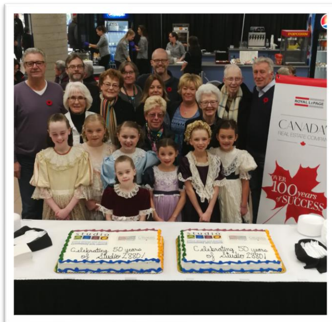
Celebrating a record year at Studio Fair.