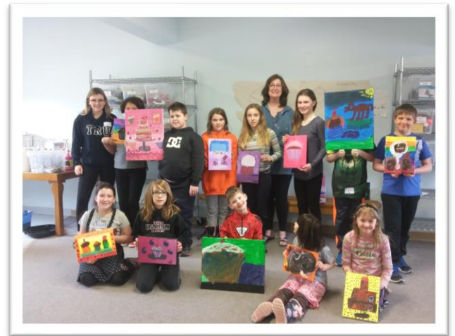
Art Monkeys is funded by BC Gaming, PG Community Foundation & Private Donors