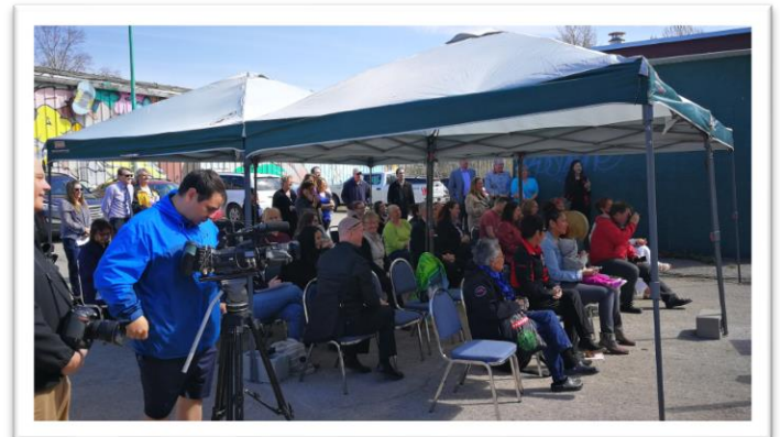
NIAC Office Opening Celebration