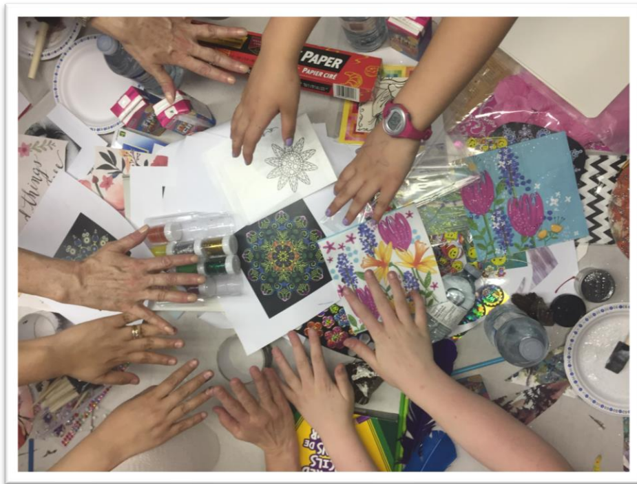
Kikiwin Art & Wellness @ Big Brothers & Big Sisters - 2018