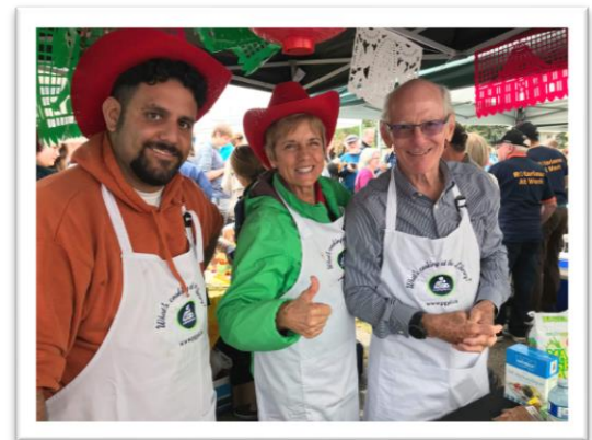
2018 Chili Champions!